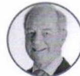
Lord Peter Lilley Member of the House of Lords, United Kingdom